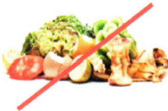
NO Food Waste