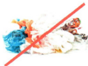
NO Plastic Bags & Film

(Find a recycling site at plasticfilmrecycling.org .)