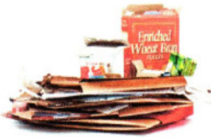
Flattened Cardboard & Paperboard