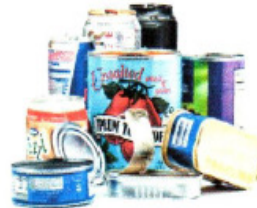
Food & Beverage Cans