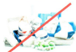
NO Foam Cups & Containers

(Find a recycling site at plasticfilmrecycling.org .)